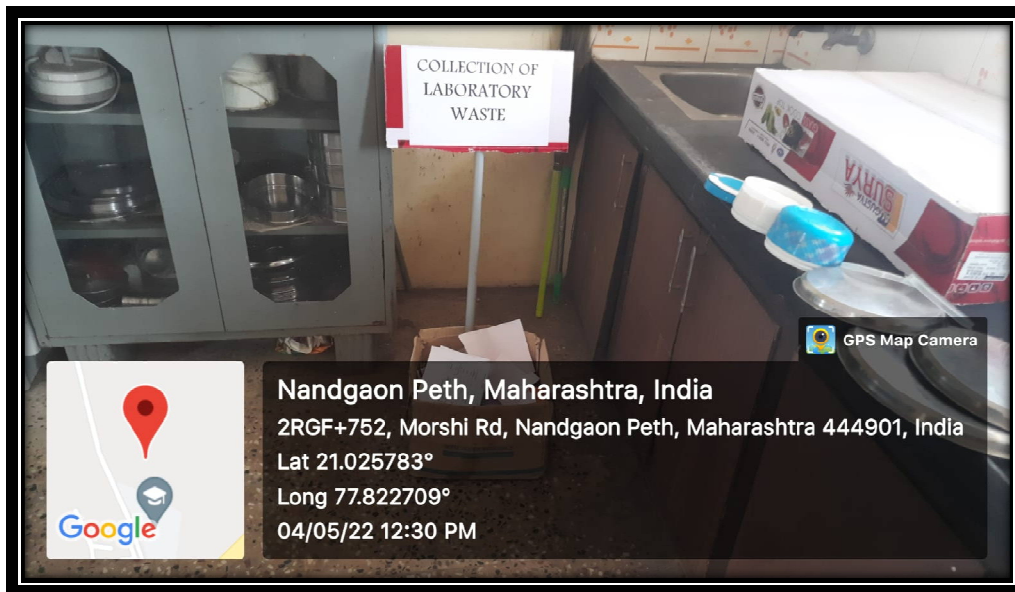
Collection of Laboratory Waste