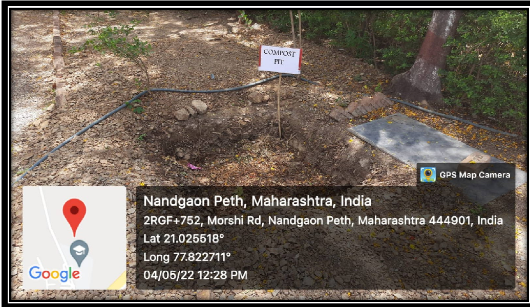
Compost Pit for Solid Waste Management